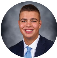
Cameron Nohos Court 513 | Hammond, IN