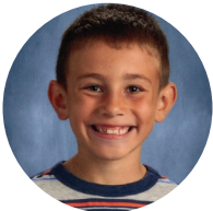
William Teixeira Court 1055 | Mosinee, WI