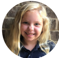
Brooklyn Utley Court 513 | Hammond, IN