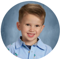
Gray Trzebiatowski Court 306 | Polonia, WI