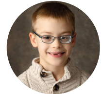
Riley Gully Court 9977 | Minnesota