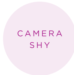
Destinee Cenita Court 1211 | Portland, OR