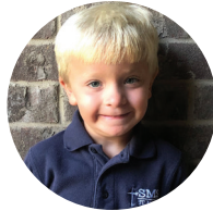
Hunter Utley Court 513 | Hammond, IN