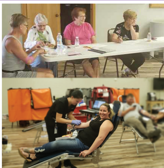
St. Mary Magdalen Court 117 Mantador, ND

NEW! Our next 1891 Financial Life magazine will be out in December 2021! The deadline to send in your picture and story for the next issue will be is NOVEMBER 1, 2021.