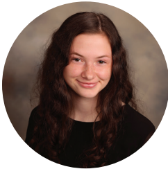
Margaret Krupp Court 850 | Marathon, WI