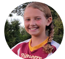
Layla Lombard Court 870 | Fort Wayne, IN