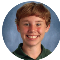
Ava Teixeira Court 1055 | Mosinee, WI