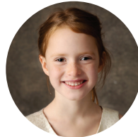
Mackenzie Gully Court 9977 | Minnesota