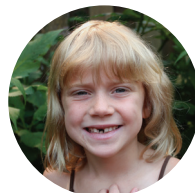
Stella LaCasse Court 998 | Rudolph, WI