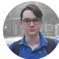
Brian Crum Court 771 | Webster, SD