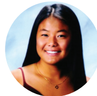
Angela George Court 9965 | Ohio