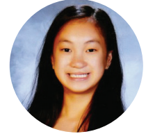
Miriam George Court 9965 | Ohio