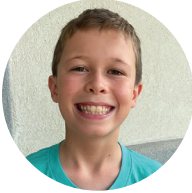
Isaac Bartel Court 9963 | Oregon