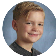
Grafton Johnson Court 9977 | Minnesota