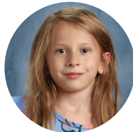
Reese Trzebiatowski Court 306 | Polonia, WI