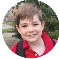
Jacob Crum Court 771 | Webster, SD