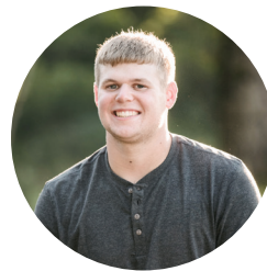
Brady Traeger Court 593 | Woodburn, OR