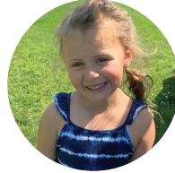
Grace Feltz Court 998 | Rudolph, WI