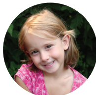
Camille LaCasse Court 998 | Rudolph, WI