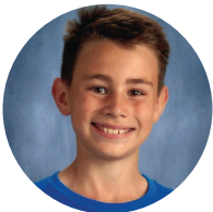
Antonio Teixeira Court 1055 | Mosinee, WI