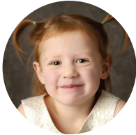
Abigail Gully Court 9977 | Minnesota