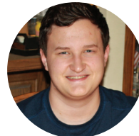
William Kohrman Court 870 Fort Wayne, IN