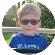
John Schmidt Court 1209 St. Louis Park, MN