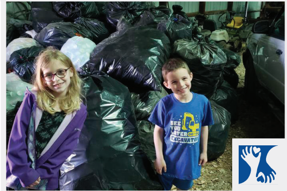
St. Mary Magdalen Court 117 Mantador, ND

St. Mary Magdalen Court 117 held their annual aluminum can collection to raise funds for Alzheimer's. They collected 889 lbs. at 40 cents each for a total of $355.60! A Court 117 member also donated $156.60. 1891 Financial Life matched $199 for a total donation of $711.20. Great job!