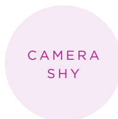
Gracie Dahler Court 743 | Morrisonville, IL