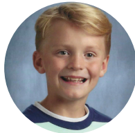
Garrison Johnson Court 9977 | Minnesota