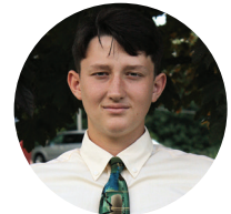
Isaac Kohrman Court 870 | Fort Wayne, IN